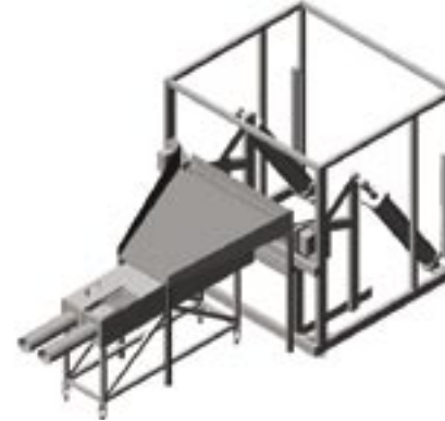
Hoist feeding one stuffer, exiting to the front.