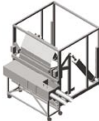
Hoist feeding stuffer exiting to the right.