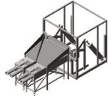
Hoist feeding two stuffers, exiting to the front.

Custom hoppers can be designed to tip onto any machine or work surface.